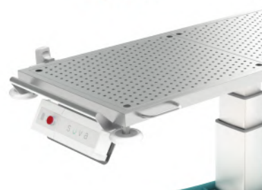
Perforated Top 4H805PS