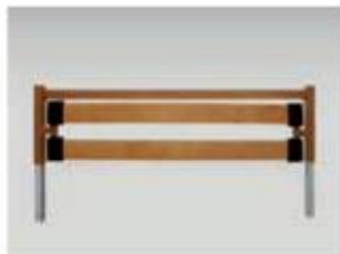
Bed extension including extra-high safety side rails (also for retrofitting)