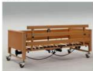
Clip-on extra-high safety side rail