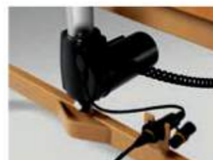
Power socket for connecting the electronic switch mode power supply unit