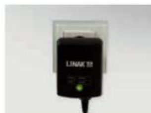
Electronic switch mode power supply unit integrated immediately after the mains plug