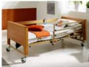
Adaptable safety sides