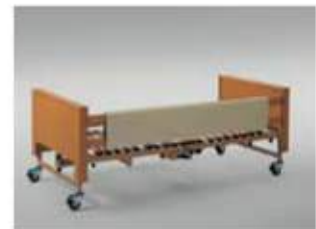
Foam leather cover