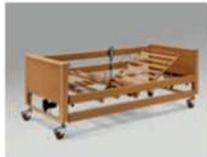
Mattress base with metal supporting bars