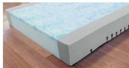
▲ Sky-fit model with high-quality Skytherm® top layer.

If people being cared for spend long periods in bed, original Burmeier mattresses offer an ideal combination of comfort and prevention. They are precisely tailored to the mattress base sections and accommodate every movement. When the backrest and thigh rest are adjusted, they therefore provide ideal pressure relief. The Sky-fit and Comfort-fit models are also reversible mattresses with one smooth side and one side with incisions. As a result, these mattresses are never "too hard" or "too soft" – they can simply be turned over and offer two different lying sensations.