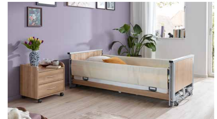
▲ Fabric Softcovers in attractive colours – here, in vanilla – encase the safety side.