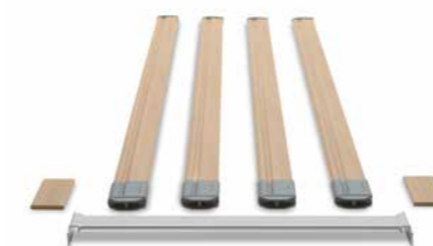
▲ The optional extension set allows ideal use of the integrated bed extension.

With original accessories from Burmeier, the Lenus can be transformed to a bed that leaves nothing to be desired. Already integrated is a pull-out extension of the bed frame by a length of 20 cm. To enable its use, an extension set with an additional mattress base section, plus longer safety side bars and infill pieces for the side panels, is available as an option. A perfect-fit mattress piece is also available for extending the mattress. A reading lamp and under bed light provide pleasant light and safe orientation at night. The optional foam leather cover protects restless users from knocking against the safety side. A practical tray for meals is simply placed on top of the safety side.