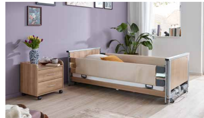
▲ Foam leather covers protect from knocking against the safety sides.