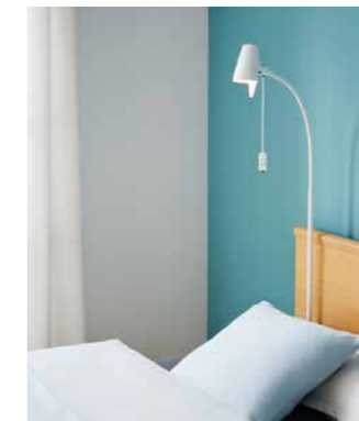
▲ Reading lamps can be inserted into the sleeve or attached to the patient lifting pole.