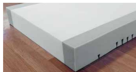
▲ Comfort-fit model with edge-zone reinforcement.