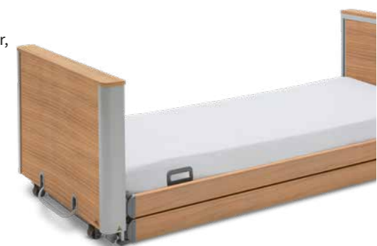
▲ Wooden surrounds attractively encase the headboard and footboard.

For maximum well-being, we recommend the comfort mattress base made of 50 free-floating spring elements.