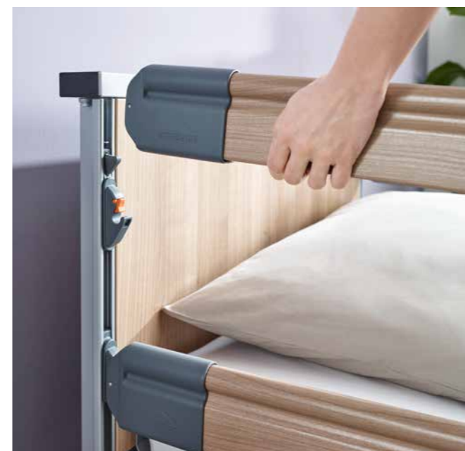
▲ The Easy Click system makes for easy and effortless assembly and dismantling.