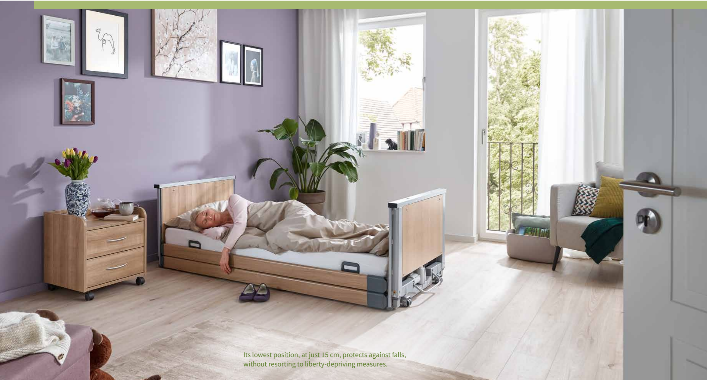
Its lowest position, at just 15 cm, protects against falls, without resorting to liberty-depriving measures.