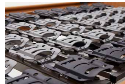
▲ The comfort mattress base ensures ideal pressure distribution thanks to 50 free-floating spring elements.