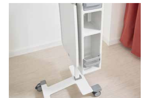
▲ The hygiene-friendly design of the Quado lends itself to easy and thorough reprocessing.