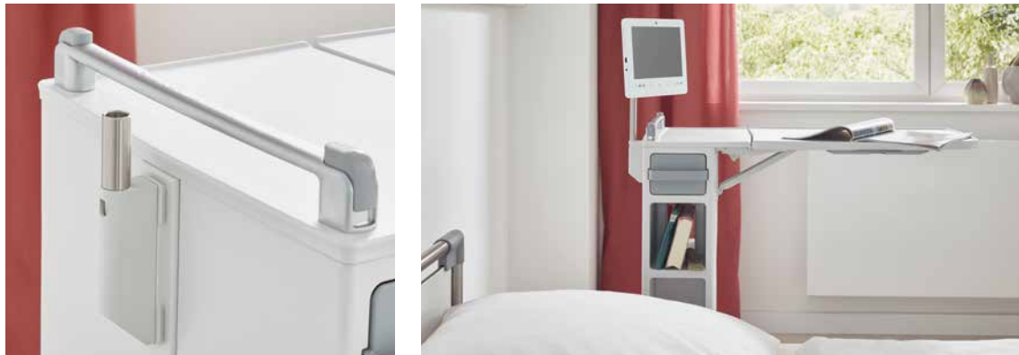
▲► The optional sleeve for telephones and multimedia systems allows action in accordance with the patient's needs and the rooms' features.