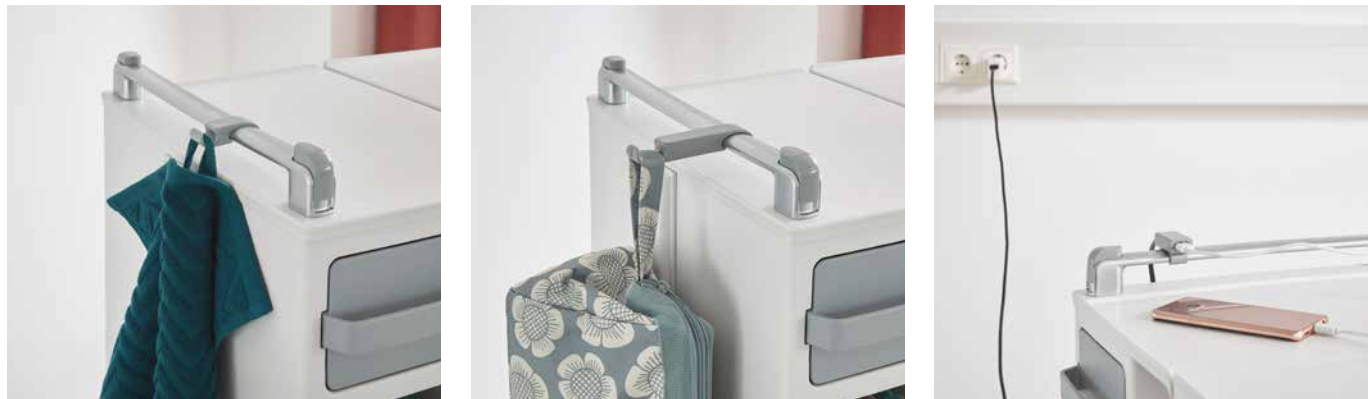
▲ With a towel hook on the rail of the bedside cabinet the towel is always at hand for the patient. ▲ With the longer hook toiletry bags can also be stowed close to the patient. ▲ An attachable USB extension cable allows charging of mobile devices in reaching distance of the patient.