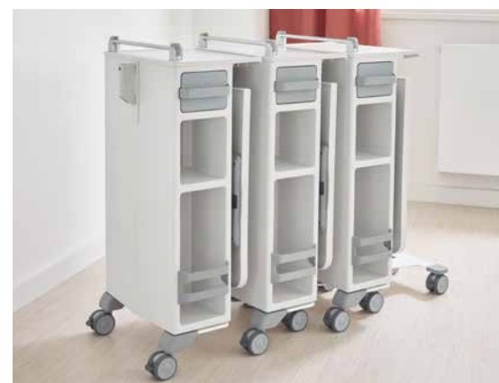
The Quado bedside cabinets ▶ can be pushed together for storage to save space.

height adjustment. Once the Quado has arrived at its destination, it can be safely parked next to the bed thanks to its castors with brakes.