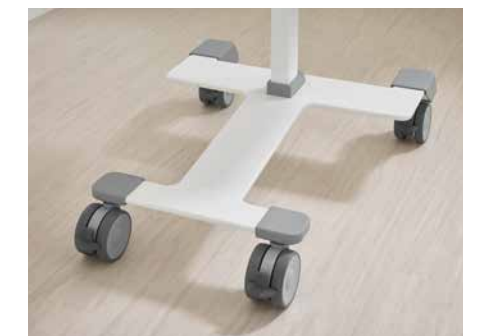
▲ The chassis ensures high stability and straightforward cleaning.