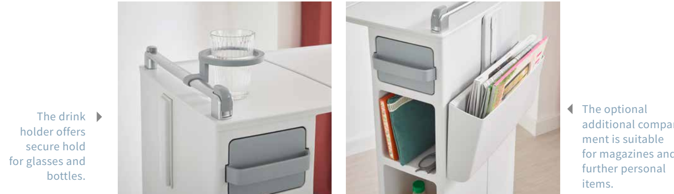
► The drink holder offers secure hold for glasses and bottles. ◀ The optional additional compartment is suitable for magazines and further personal items.