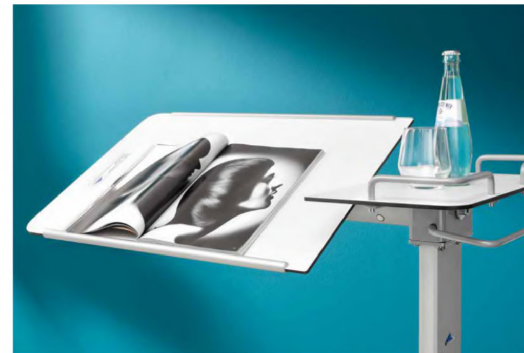
◀ Split and horizontal tilting table top