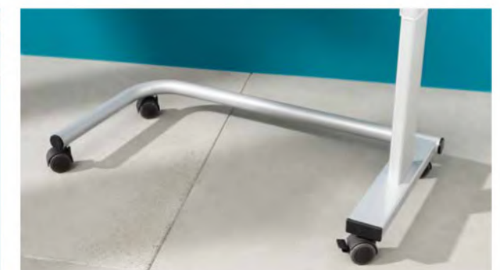
▲ A strong chassis provides stability