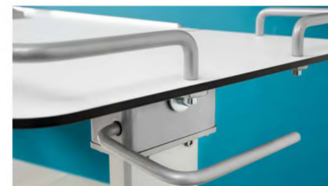
▲ The height adjustment lever is within easy reach