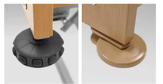
Wall deflection roller, including mount, for: Regia (left), Westfalia IV, Westfalia-Klassik (right, Ø=60 mm oder Ø=100 mm)