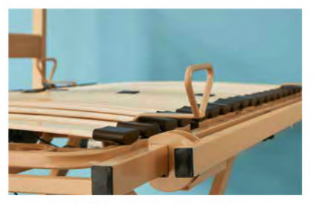
Widening rail, 5 cm (Lippe IV only)