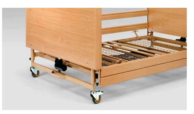
Wooden panels for the chassis, including mounting materials, for: Allura-II series, Dali II, Dali-Low Entry, Economic II/III (image: typical example)