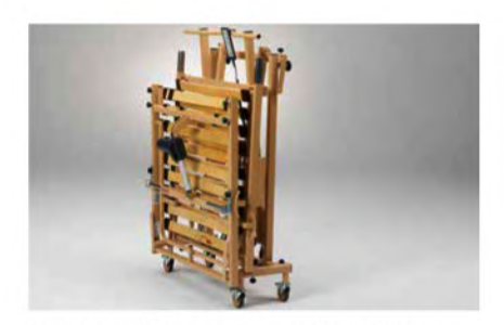
Transportation and storage aid with steerable castors (Lippe IV only)