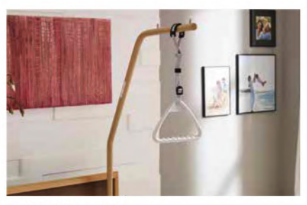
Patient lifting pole