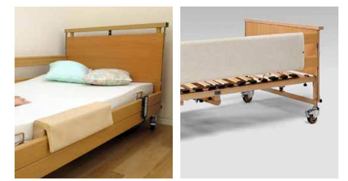
Extension cushion (left) and foam leather cover (right) for all models with full-lenght safety sides