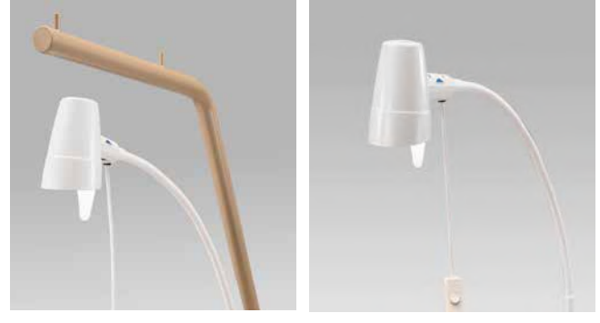
Reading lamp, fixed to patient lifting pole with clamp (left) or integrated into existing sleeve for patient lifting pole (right); available for all models