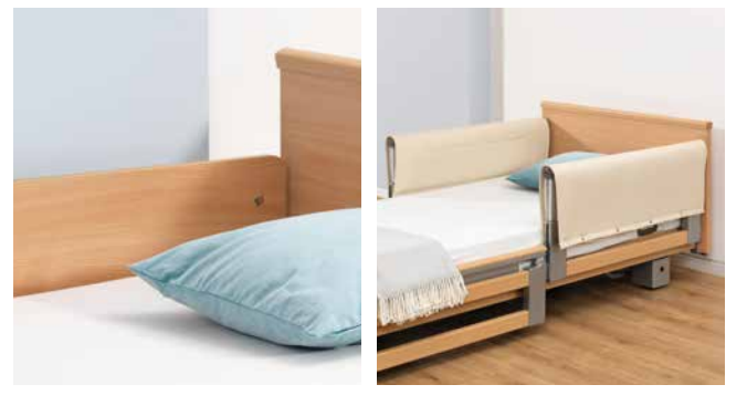
Fixed board along the side of the bed (left) and foam leather cover (right) for Regia, Inovia and Inovia 100