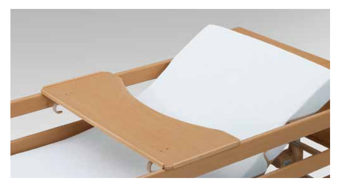
Tray that rests on the raised safety sides (also for 100 cm mattress base) for: Allura II 100, Arminia III, Dali II, Dali-Low Entry, Economic II/III, Inovia and Inovia 100, Westfalia IV, Westfalia-Klassik