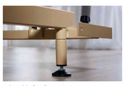
Adjustable feet for raising the lowest position (+ 7 cm)