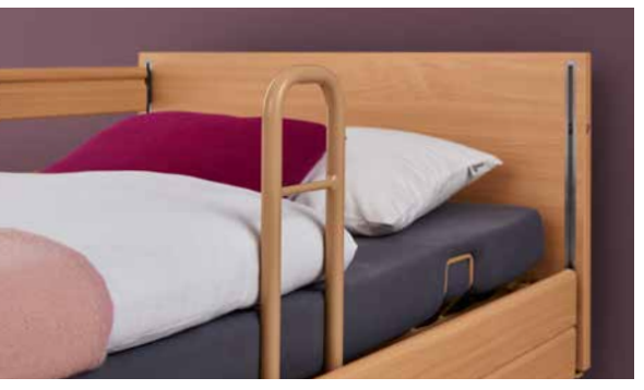
Standing aid for: Allura-II series, Arminia III, Dali II, Dali-Low Entry, Economic II/III, Westfalia IV