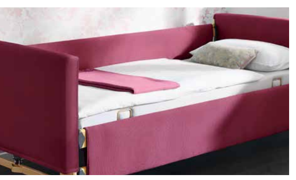
Softcovers for: Arminia III (safety sides only), Economic II/III, Dali II, Dali-Wash