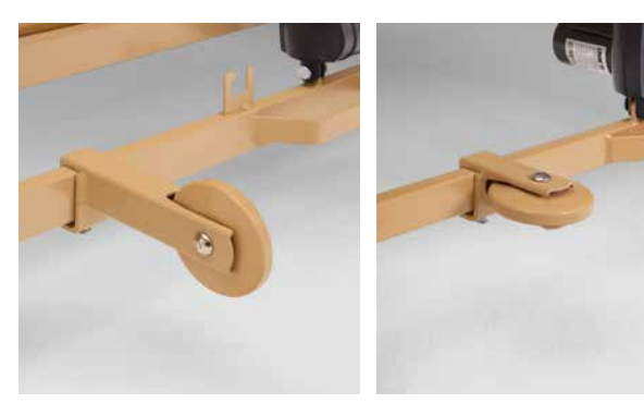
Wall deflection roller, including mount, for: Allura-II series (left), Arminia III, Dali II, Dali-Low Entry, Economic II/III (right)