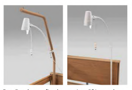
Reading lamp, fixed to patient lifting pole with clamp (left) or integrated into existing sleeve for patient lifting pole (right)