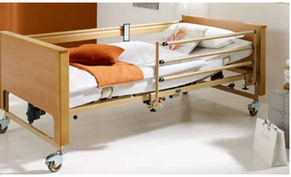
Adaptable safety sides for: Arminia III, Dali II, Economic II/III, Lippe IV, Westfalia IV