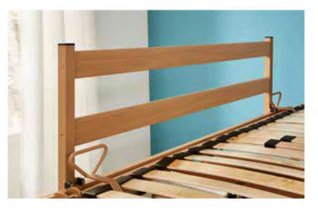
Safety sides, also possible in combination with widening rail (Lippe IV only)