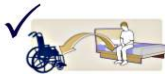
Bed to Chair/Chair to Bed (From seated position only)