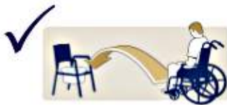
Chair to Commode/Toilet