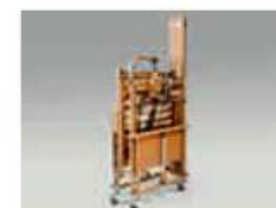
Compact delivery and storage on storage aid/transportation aid