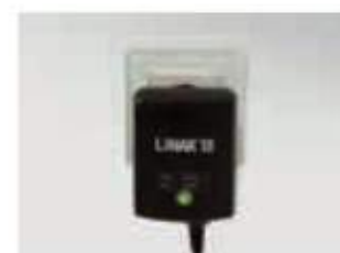
Electronic switch mode power supply unit integrated immediately after the mains plug