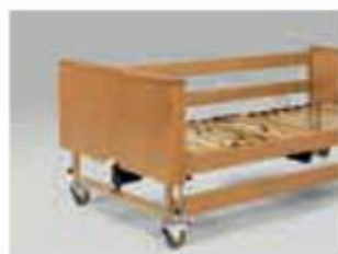
Wooden panels for the chassis (also for retrofitting)