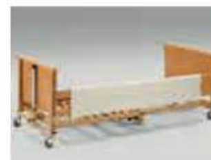
Foam leather cover