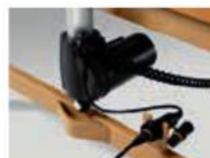
Power socket for connecting the electronic switch mode power supply unit