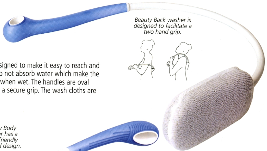
Beauty Back washer is designed to facilitate a two hand grip.

Beauty is our award-winning range of ergonomically designed body care products. Each product has a unique shape that makes reaching when washing and hairstyling easy. The products are all carefully designed to provide maximum strength with minimal effort or strain on hands, arms and shoulders.