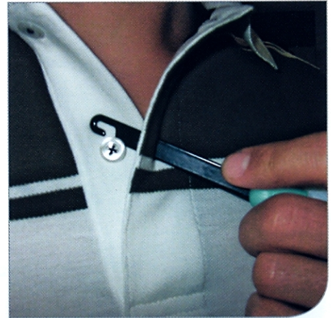
Butler buttoner, round

The long handled model can be used for all types of buttons, even jeans metal buttons