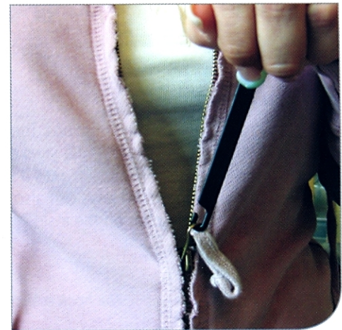
Butler buttoner, long