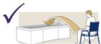
Transfer to Bath