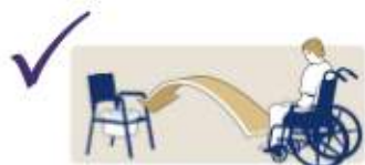
Chair to Commode/Toilet