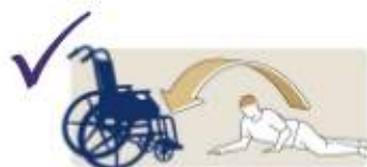
Floor to Bed/Chair