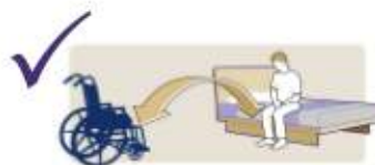
Bed to Chair/Chair to Bed