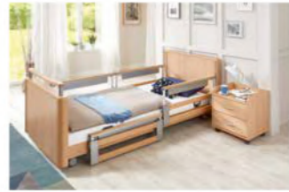
Telescopic safety side (TSG).