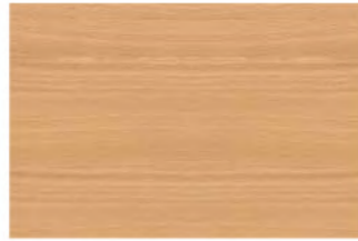
Natural Beech (standard).