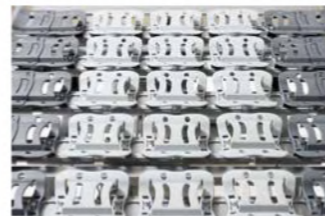
The comfort mattress base comprises 50 free-floating spring elements.