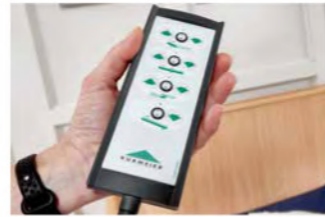
Handset with selective locking.