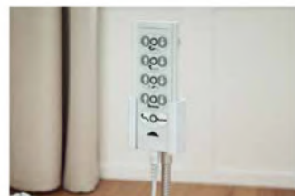
Flexible transmitter holder for the handset.