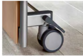
Castors can be locked in pairs whatever the mattress base position.