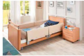
Foam leather cover for TSG.