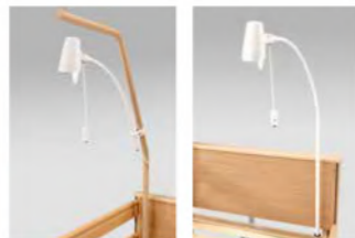
Sola reading lamp.