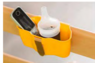
The storage tray for glasses, mobiles or care utensils can be attached to the full-length safety side.