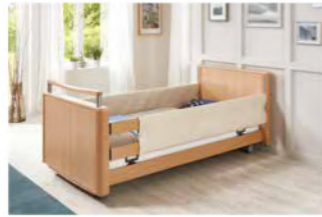
Foam leather cover for DSG.