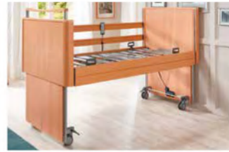
Mattress base height adjustable from 22 to 77 cm, adjustment range = 55 cm.