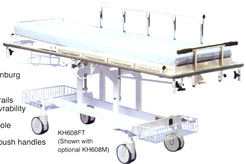
KH608FT (Shown with optional KH608M)