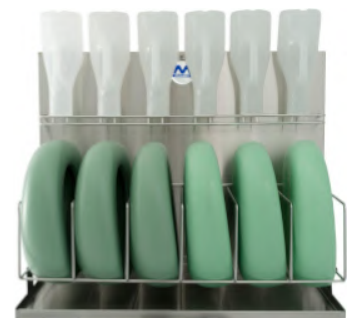
Bedpan/Bowl and Urinal Racks