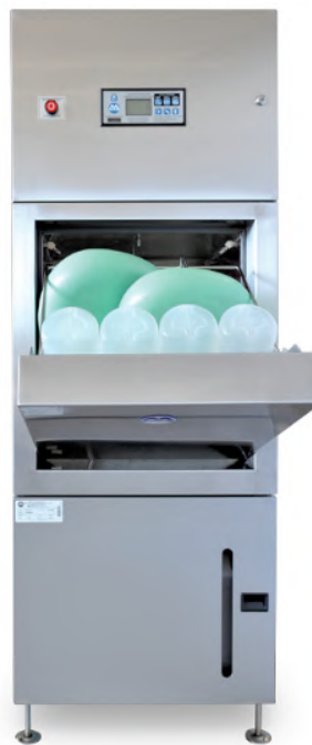
Combination Bedpan and Utensil Washer Disinfector