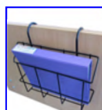
Patient Chart Holders - White or Black Hang on the bed or screw to the wall