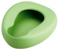
Heavy Duty Autoclavable Bed Pan