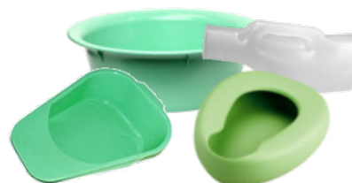
Hospital autoclavable plasticware

Bed Pans Slipper Pans Urinal Bottles Bowls