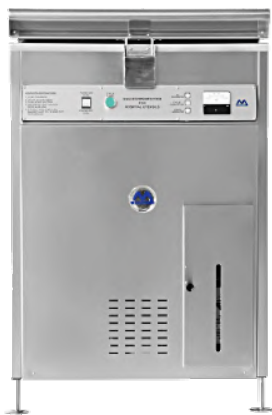
Utensil/Bowl Washer Disinfector, top loading