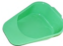
Autoclavable Slipper Bed Pan (Standard & Bariatric)