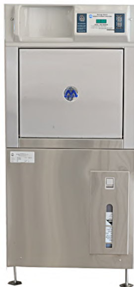
Energy Saver Bedpan Washer Disinfector