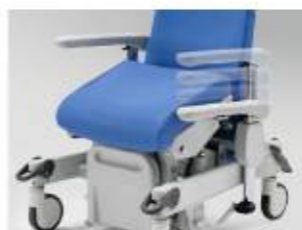
Armrest height adjustment in 6 stages