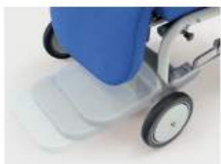
Ravello-Sano: The footrest can be fully retracted