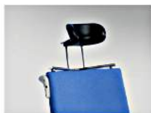
Special headrest with lateral support