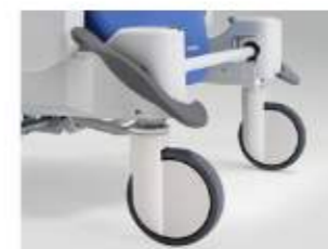
Ravello-Sano and Ravello-Curo are both available in an S version for easier manoeuvrability