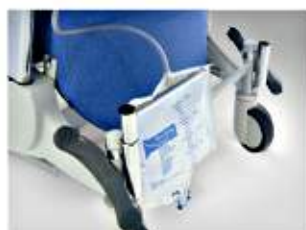
Urine bag holder