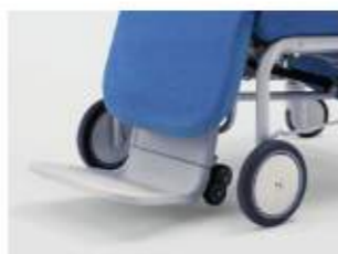
Ravello-Curo: Length-adjustable, fixed position footrest that tilts to follow backrest adjustments