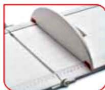
The measurement results are easy to read from the large scale.

The lightness of the measuring board is matched by the high quality of the folding mechanism, head piece and foot positioner. Special attention is paid to the choice of materials which can stand up to years of tough use without losing their shape. Additional protection is provided by the seca 412 carrier bag made of water-repellent lightweight nylon.