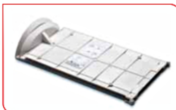
The high-quality folding mechanism guarantees a long service life.